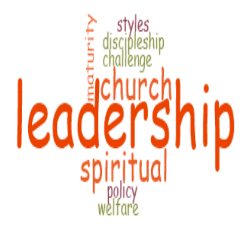
Figure 5: Church Leadership practices hinder discipleship in CCM Shiroro.

Figure 5 depicts the themes that emerged when the informants were asked to explain how church leadership could be working as a hindrance to church growth the emerging themes leadership, church, spiritual, challenges, policy, discipleship, style, etc. Which the researcher used to derive the subheadings under research question number 4.