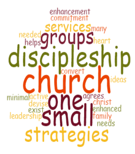
Figure 2: Strategies used hinder discipleship in CCM Shiroro?

Figure 2 indicated the themes that emerged in response to strategies which are used to hinder church discipleship some of the themes that emerged from the informants in response to the research question 1 are as follow: discipleship, strategies, church, small, groups, enhancement, services. In which the researcher used to pick the subheadings of this question.