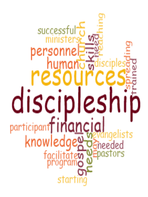
Figure 3: church resources hinder discipleship in CCM Shiroro

skills, personnel, human, pastors, from which the researcher used to derive the subheadings in response to research question number 2.