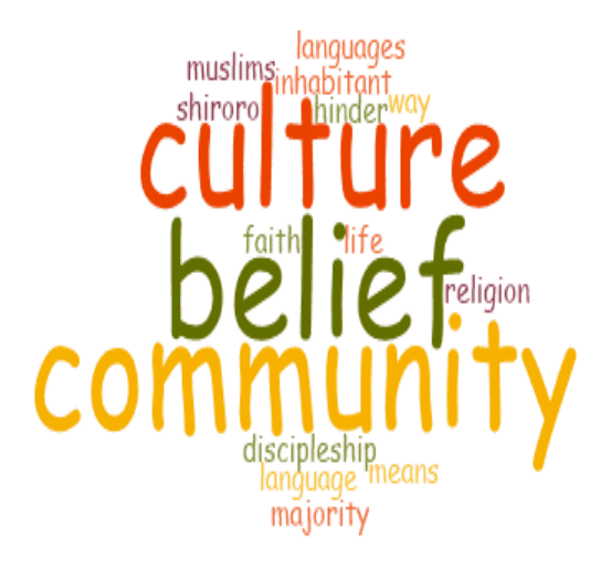
Figure 4: Culture hinder discipleship in CCM Shiroro?

Figure 3 depicts the themes that emerged when the informants were asked to explain how culture could be working as a hindrance to church growth the, which the following themes emerged: Culture, community, belief, language, religion, faith life. From which the researcher derived the subheading which arouses from the research question number three.