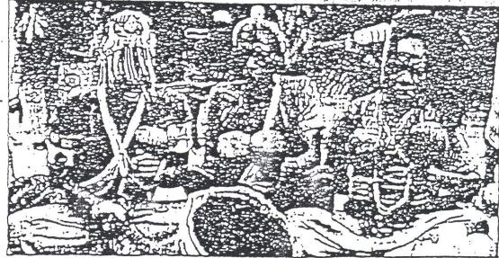
A group of witchdoctors demonstrate some of the paraphernalia they use to exorcise spirits and other bad forces.